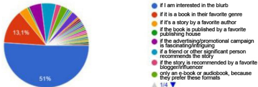
Figure 3. Prospects for purchasing books on the subject

Let's imagine that Ukrainian bookstores (physical and online) have books for teenagers by Ukrainian authors that, among other topics, also address the LGBTQ(IA+) community (including homophobia). What will you do? Please choose ONE answer or fill in the «other» option.